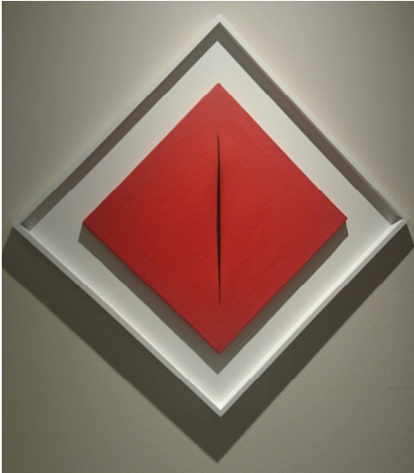
Lucio Fontana Concetto Spaziali, Attesa (1964)

Surface must not be limited by the edges of the canvas, it extends to the surrounding space," said Fontana in 1967.