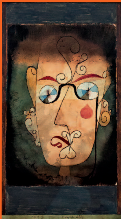
Comic Old Woman 1923

Paul Klee was not only among the visual artists of the 20th century who were most deeply involved with music, but was also the one whose paintings found the broadest echo with musicians and composers. Klee himself picked up stimuli from music, and also gave them in return. Over 450 compositions from the 1940s until the present day have made reference to Klee and one or other of his paintings. The inspiration by Klee extends to the present day. On the accompanying musical evenings, a wide variety of prominent compositions are interpreted in different line-ups, including a complete cycle by the French composer Francis Poulenc, consisting of seven songs.