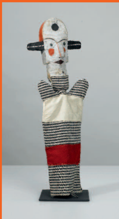
Untitled (Big-Eared Clown) , 1925